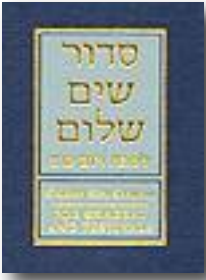
Sim Shalom Siddur