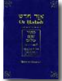
Or Chadash Commentary